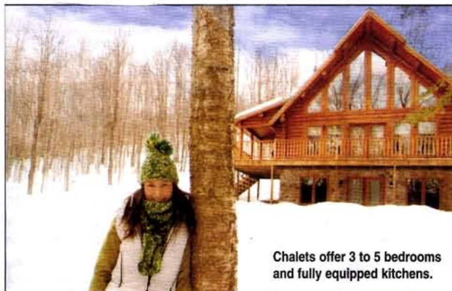
Chalets offer 3 to 5 bedrooms and fully equipped kitchens.