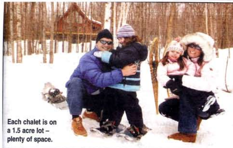
Each chalet is on a 1.5 acre lot – plenty of space.